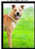
Red Sky Rescue