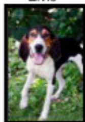
Red Sky Rescue